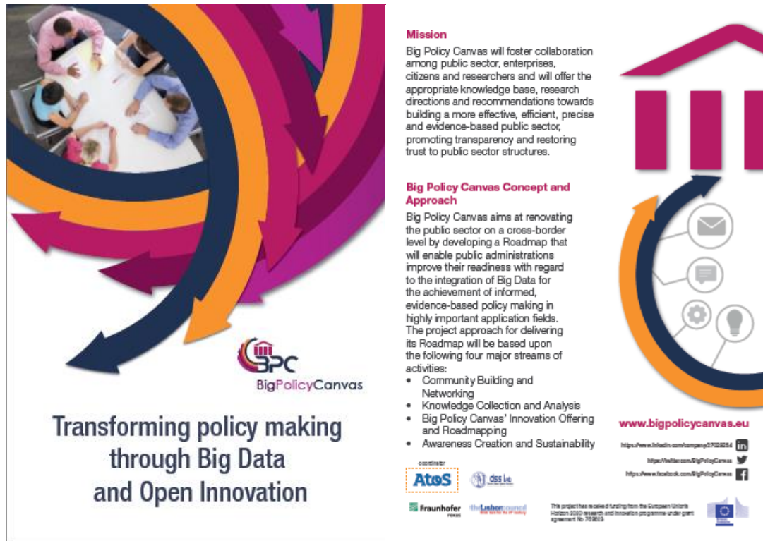
Figure 2-4: Big Policy Canvas leaflet