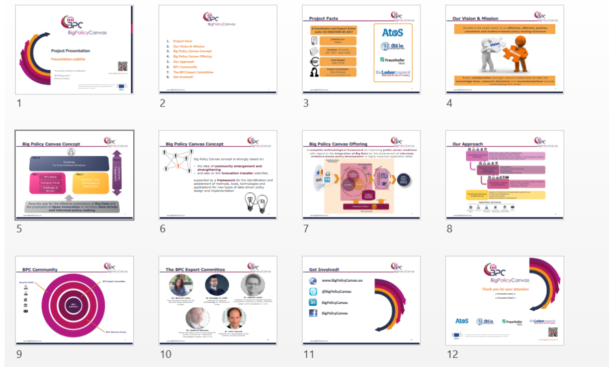
Figure 2-2: Big Policy Canvas project presentation

A Big Policy Canvas project presentation has been created like part of the different dissemination tools designed to support the Big Policy Canvas dissemination efforts. This presentation includes essential information about the project, such as the profile of the consortium, the project concept approach and the BPC Experts Committee. Additionally, it provides information on how to get involved in the BPC network.